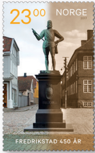
NK 1961 Statue of King Frederik II in the square in Gamlebyen in Fredrikstad. On the stamp the king has one foot in the past and one foot in the present.