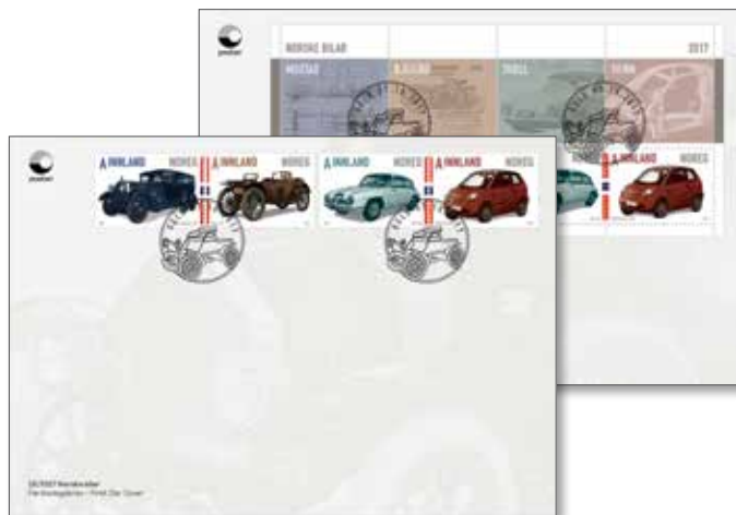
◀ First Day Cover NOK 58