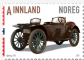
NK 1967 Bjerger from 1921 was built to be narrow because the Norwegian roads were so poorly ploughed it was difficult to drive on them. The car came with the option of switching out the front tyres with runners in the winter.