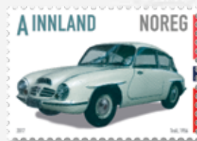
NK 1968 Troll was produced in Lunde in Telemark between 1956 and 1958. In total, five cars of this type were produced.