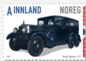
NK 1966 Mustad Giant was ahead of its time in 1917 with room for 12 people and the ability to steer the front rear axle (like today's buses).