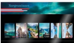
Presentation Pack NOK 186