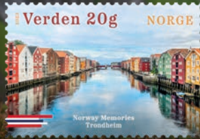
NK 2098 Wharf buildings in Trondheim