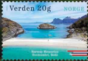
NK 2097 Hovdsundet, near Bodø