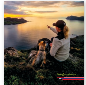
Collector's Set NOK 362