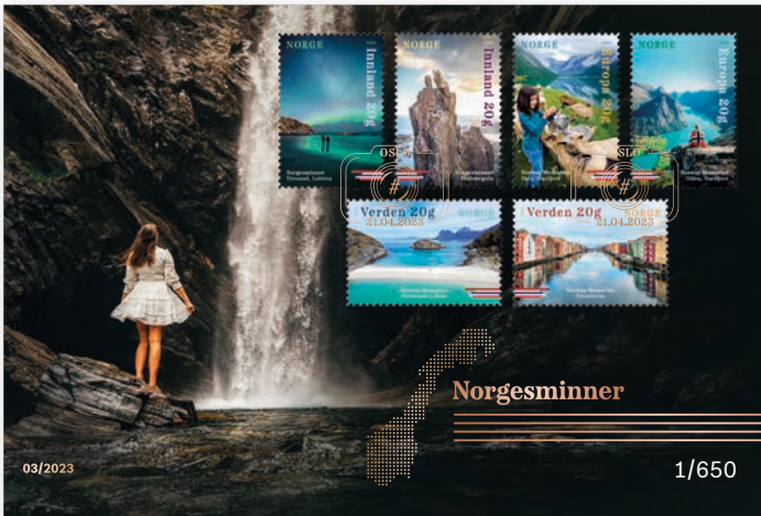
Golden FDC NOK 178